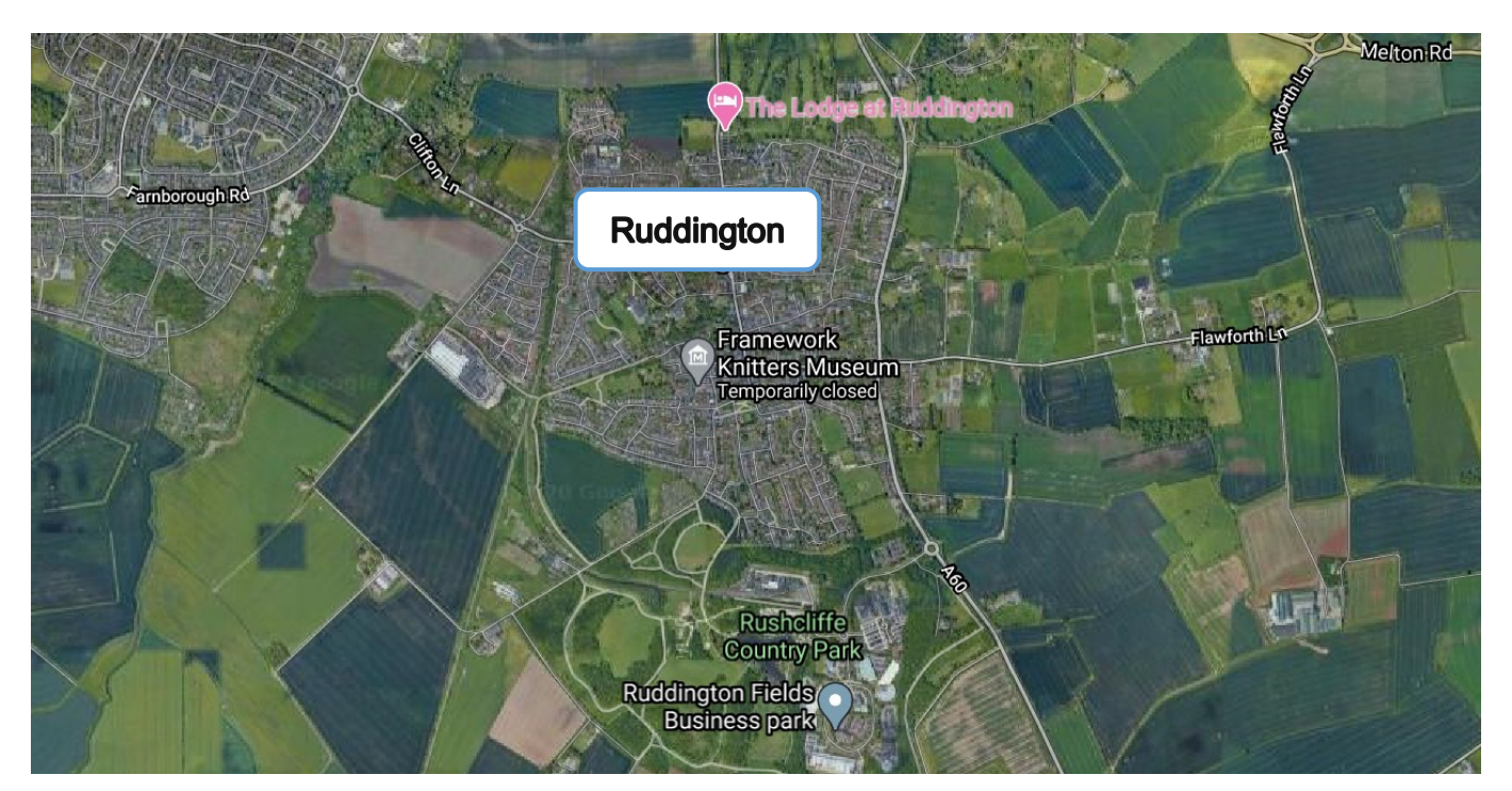
Figure 1. Location Plan

The storms resulted in some areas experiencing over two weeks worth of rain in just two hours resulting in 22 business in the centre of Ruddington suffering internal flooding.